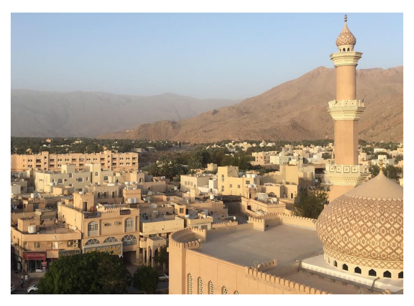
View from Nizwa Fort, Oman. Oman has taken significant steps to begin diversifying its economy, particularly focusing on education.

One major challenge that participants repeatedly underlined was that of human resources. GCC countries are falling short of accumulating human capital even with high levels of spending on education. Participants underlined the need to focus on science, technology, engineering, math (STEM) as well as "digital education for digital employment," all coupled with gender policy, in order to increase employability skills of graduates. One participant contended, "It is not necessarily the skills that are missing, but it is the new generation of workers that see themselves as entitled." Others said that human capital could indeed be an asset if it receives investment.